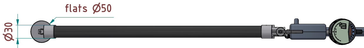
A ( 1 : 2 )