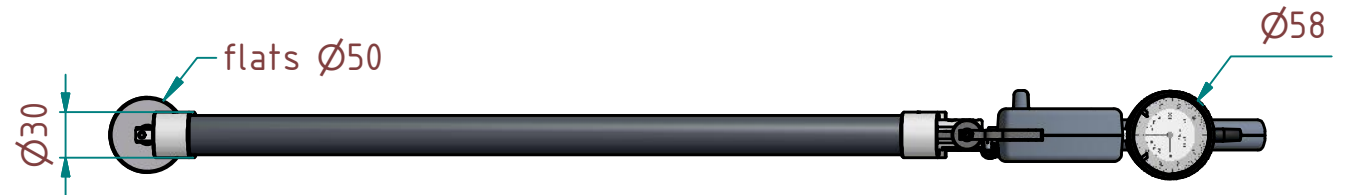
B ( 1 : 2 )