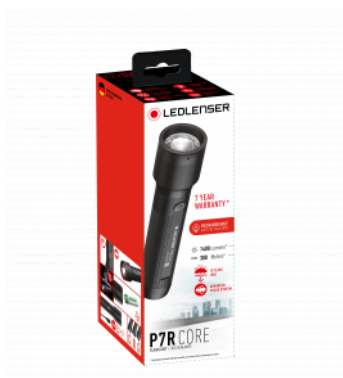
Exemplary Packaging Illustration