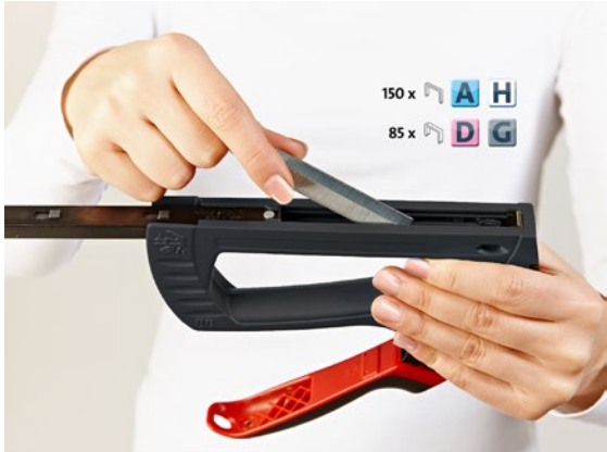
This tacker can hold 150 A type 53 or H type 37 fine wire staples, or 85 D type 53 F or G type 11 flat wire staples.