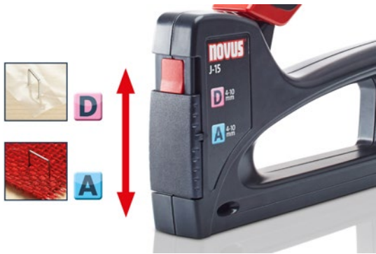
The tacker can be easily adjusted for working with fine and/or flat wire staples using the slide mechanism on the front of the device.