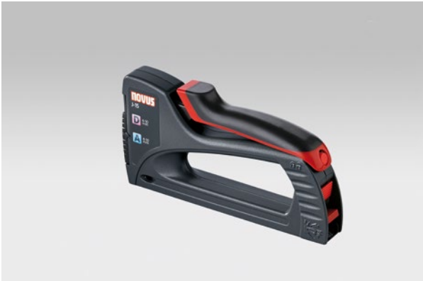
The tacker handle can be locked down when not in use or for storage.